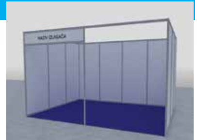
Illustration for a 12m 2 booth