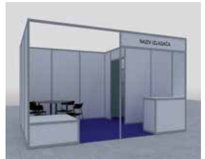
Illustration for a 12m 2 booth